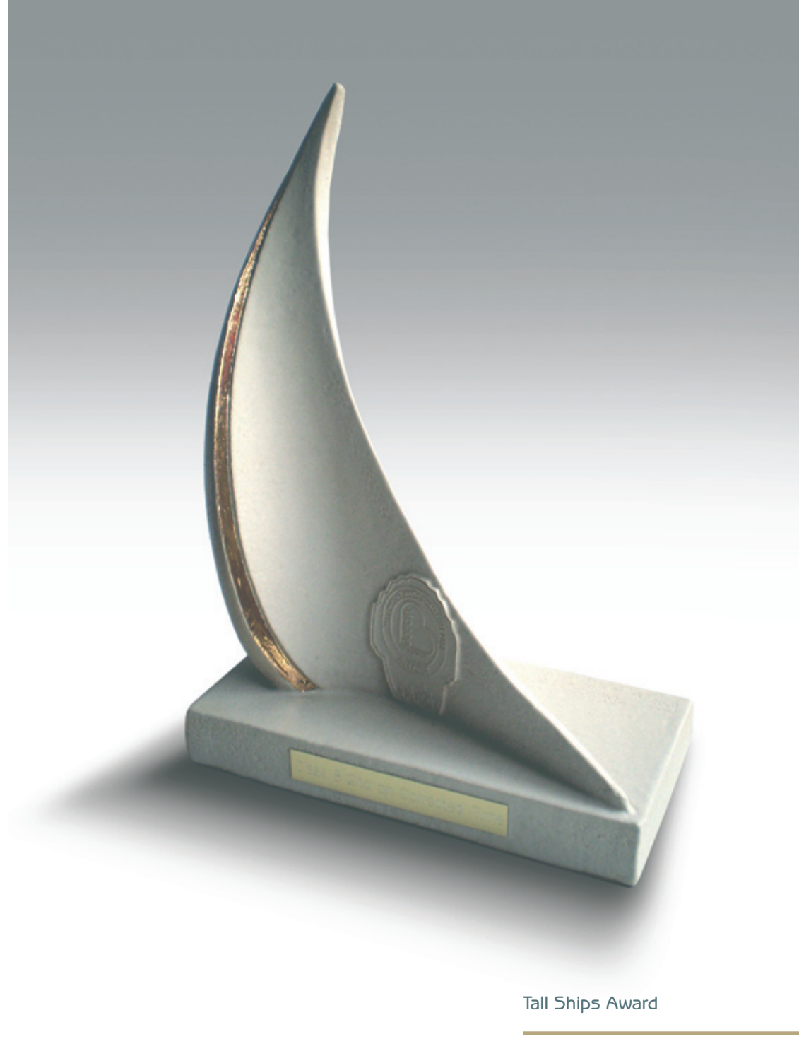
Tall Ships Award