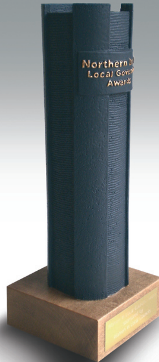
Northern Ireland Local Government Award