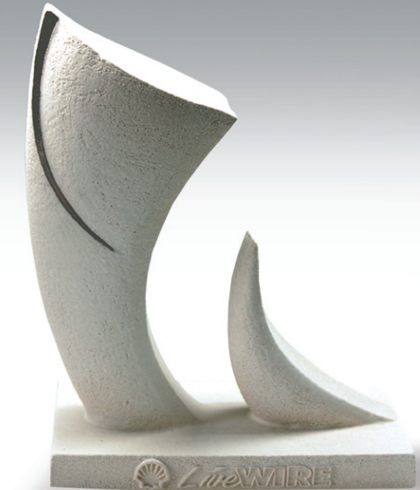
Shell Livewire Award

Customers come back year on year, thus reflecting a professional service and a high standard of workmanship.