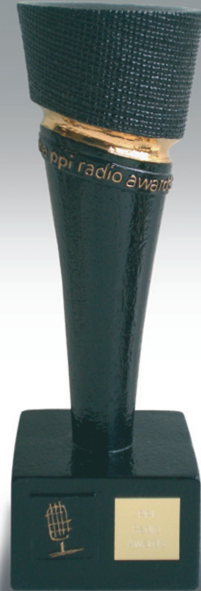
PPI Radio Award